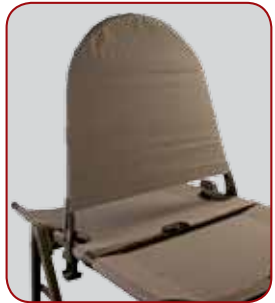
Backrest in 90° Configuration

EC REP M3 Europa GmbH Lagerhofweg 51, 71 3850 Haverhorst-Lagerhorst Germany