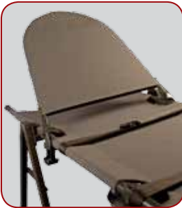
Backrest in 45° Configuration

NOTE: The backrest is made to fit snugly onto the OSL™ Litter. Therefore, it may take some effort to completely install the backrest.