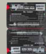
(1) HyFin® Twin Pack Chest Seals Item# 10-0031