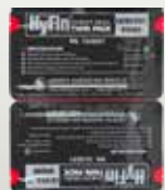
(1) HyFin® Twin Pack Chest Seals Item# 10-0031

▲ Color coded tab for easy access to your IFAK contents