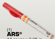
(1) ARS® 14 gauge x 3.25 in. Needle Decompression Kit Item# ZZ-0056 NSN# 6515-01-541-0635