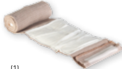
(1) ETD 4 in. (Flat Pack) Emergency Trauma Dressing Item# 30-0093