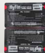
(1) HyFin® Twin Pack Chest Seals Item# 10-0031