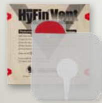
(2) HyFin® Vent Chest Seal Item# 10-0029