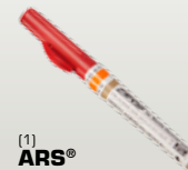
(1) ARS® 14 gauge x 3.25 in. Needle Decompression Kit Item# ZZ-0056 NSN# 6515-01-541-0635