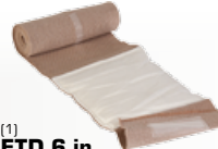
(1) ETD 6 in. Emergency Trauma Dressing Item# 30-0032 NSN# 6510-01-558-4114