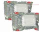
(2) S-Rolled Gauze 4.5 in. x 4.1 yd. Item# 30-0003 NSN# 6510-01-605-2234