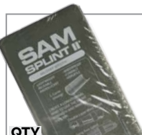
QTY 2 SAM Splint