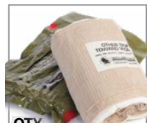
QTY 1 ETD™ Abdominal