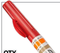
QTY 2 ARS® Needle, 14g