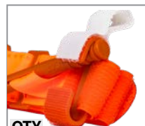
QTY 2 C-A-T® Tourniquet