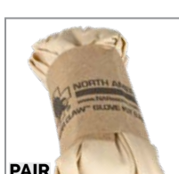
PAIR 5 Nitrile Gloves, Lg