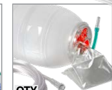
QTY 1 Cyclone BVM, Pocket