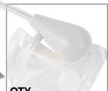
QTY 1 Tactical Suction Device