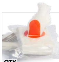
QTY 4 Gauze S-Rolled