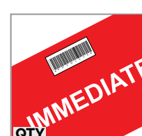
QTY 2 T2® Tag Triage Card