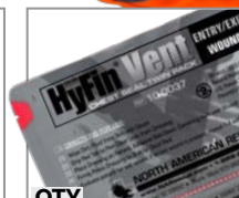
QTY 1 HyFin® Vent, Twin Pk