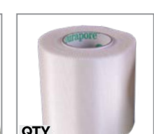
QTY 1 Surgical Tape, 2 in.