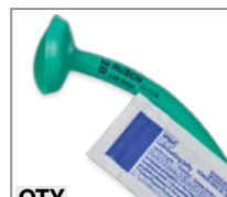
QTY 2 28F Naso Airway & Lube