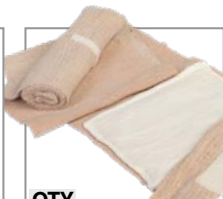
QTY 4 ETD™ 6 inch