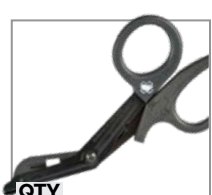
QTY 1 Trauma Shears, Lg