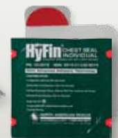
(2) HyFin® Chest Seal Item# 10-0015 NSN# 6515-01-532-8019