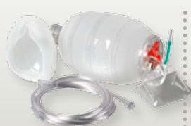
(1) Cyclone® New & Improved Pocket BVM® Item# 10-0019 NSN# 6515-01-568-0193