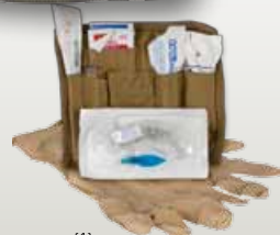
(1) Tactical CricKit® Cricothyroidotomy Kit Item# 10-0017 NSN# 6515-01-540-7568