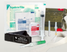
(4) NAR Saline Lock Kit Item# 30-0013 NSN# 6515-01-537-4094