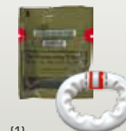
(1) BOA® IV Constricting Band Item# 30-0009 NSN# 6515-01-537-2111