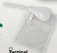
(1) Tactical Suction Device Item# 10-0018 NSN# 6515-01-540-7206