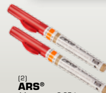
(2) ARS® 14 gauge x 3.25 in. Needle Decompression Kit Item# ZZ-0056 NSN# 6515-01-541-0635