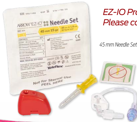
45 mm Needle Set

EZ-IO Products are restricted to Federal Purchases only. Please contact Customer Service for details.