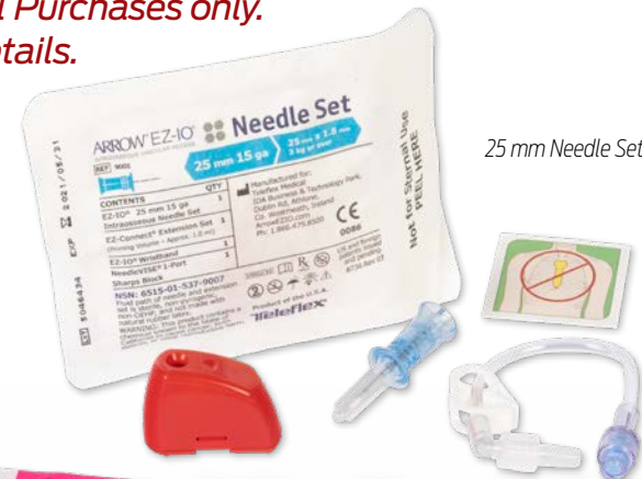
25 mm Needle Set

*Caution: Federal (USA) law restricts this device to sale by or on the order of a practitioner licensed to use or order use of the device or Federal (USA) law prohibits dispensing without a prescription.