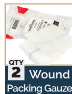
QTY 2 Wound Packing Gauze