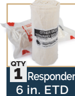
QTY 1 Responder 6 in. ETD