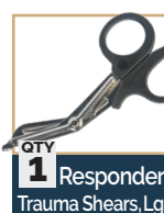
QTY 1 Responder Trauma Shears, Lg