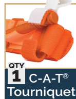
QTY 1 C-A-T® Tourniquet