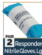
PAIR 2 Responder Nitrile Gloves, Lg