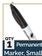
QTY 1 Permanent Marker, Small