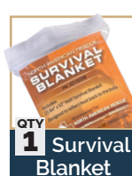
QTY 1 Survival Blanket