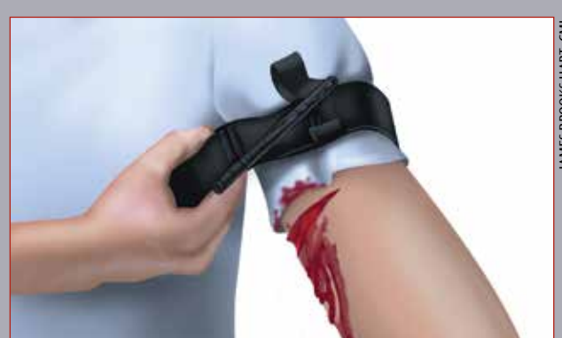
One-handed tourniquet application