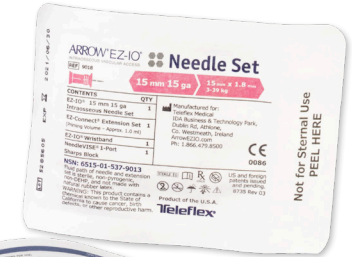
15 mm Needle Set*