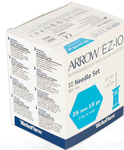
25 mm Needle Set*

*Caution: Federal (USA) law restricts this device to sale by or on the order of a practitioner licensed to use or order use of the device or Federal (USA) law prohibits dispensing without a prescription.