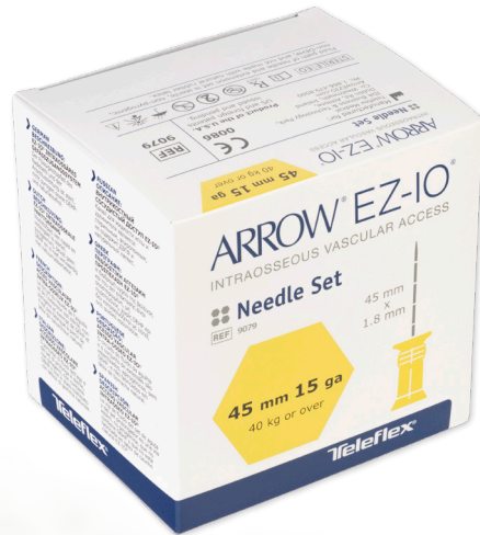
45 mm Needle Set*

EZ-IO® Products are restricted to Federal Purchases only. Please contact Customer Service for details.