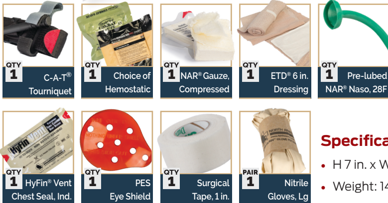
9 line MEDEVAC Card on reverse side of content card