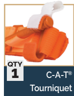
QTY 1 C-A-T® Tourniquet