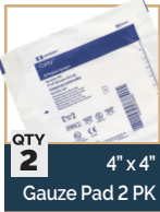
QTY 2 4" x 4" Gauze Pad 2 PK