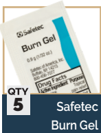
QTY 5 Safetec Burn Gel