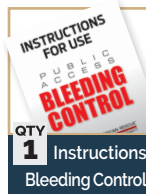
QTY 1 Instructions for Bleeding Control