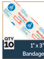
QTY 10 1" x 3" Bandage