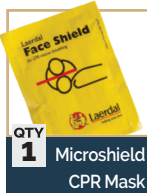
QTY 1 Microshield CPR Mask