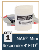
QTY 1 NAR® Mini Responder 4" ETD®