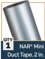
QTY 1 NAR® Mini Duct Tape, 2 in.