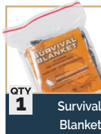
QTY 1 Survival Blanket