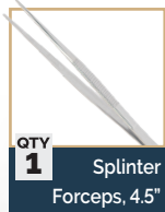
QTY 1 Splinter Forceps, 4.5"