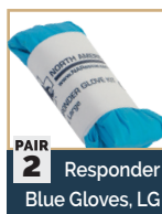
PAIR 2 Responder Blue Gloves, LG