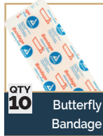
QTY 10 Butterfly Bandage