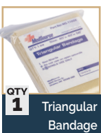
QTY 1 Triangular Bandage