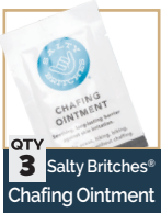
QTY 3 Salty Britches® Chafing Ointment