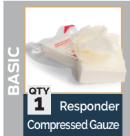
BASIC QTY 1 Responder Compressed Gauze