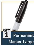
QTY 1 Permanent Marker, Large