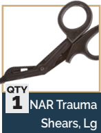
QTY 1 NAR Trauma Shears, Lg