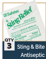
QTY 3 Sting & Bite Antiseptic