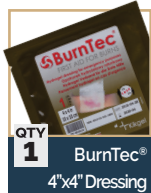
QTY 1 BurnTec® 4"x4" Dressing