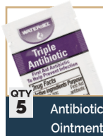
QTY 5 Antibiotic Ointment