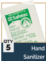
QTY 5 Hand Sanitizer