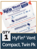
QTY 1 HyFin® Vent Compact, Twin Pk