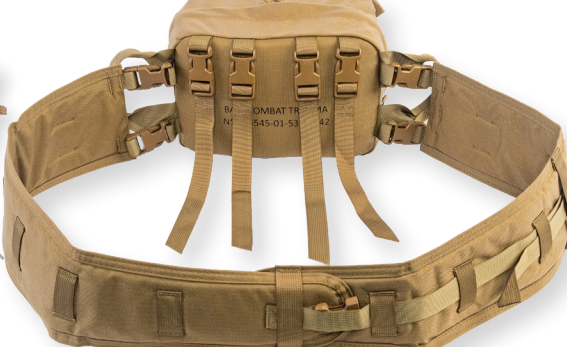
Baa only #ZZ-0252