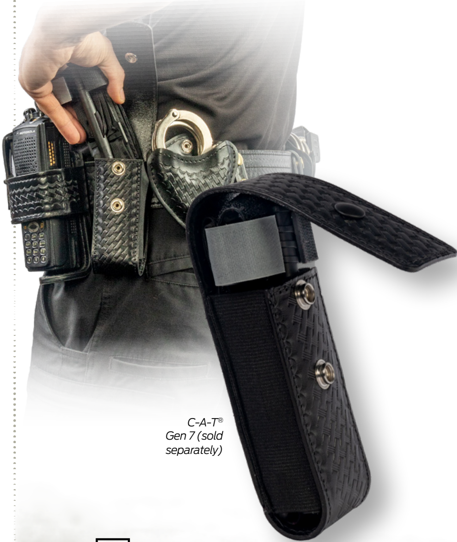
C-A-T® Gen 7 (sold separately)