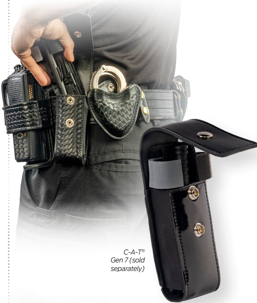
C-A-T® Gen 7 (sold separately)