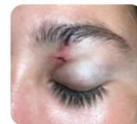
Day 1 Post Injury