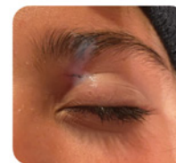
Day 3 with Treatment Applied