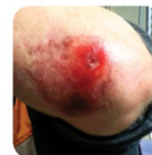
1 Day Post Treatment