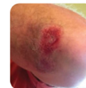
1 Week Post Treatment