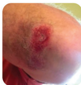
1 Week Post Treatment