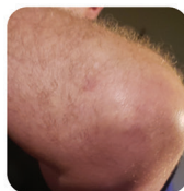
Fully Healed after 2 Weeks