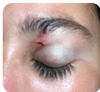
Day 1 Post Injury