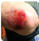
1 Day Post Treatment