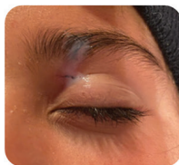
Day 3 with Treatment Applied