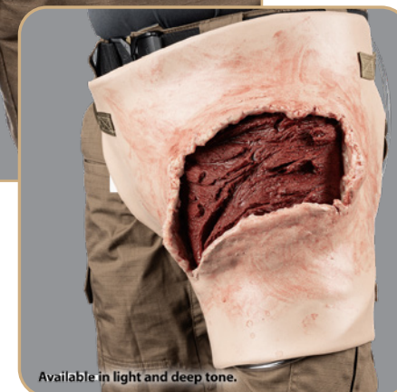
Available in light and deep tone.