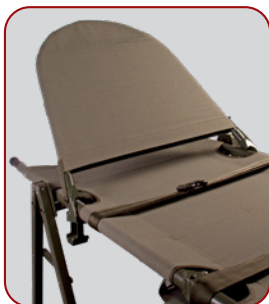
Backrest in 45° Configuration

NOTE: The backrest is made to fit snugly onto the OSL™ Litter. Therefore, it may take some effort to completely install the backrest.