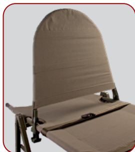
Backrest in 90° Configuration