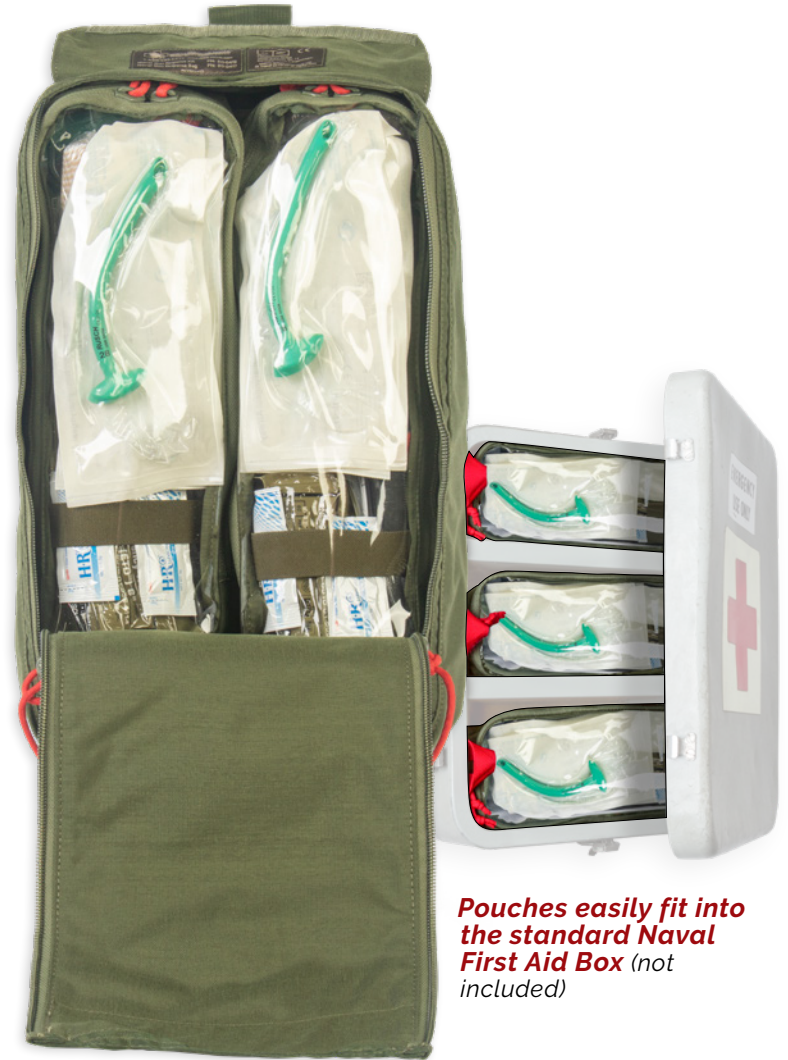
Pouches easily fit into the standard Naval First Aid Box (not included)