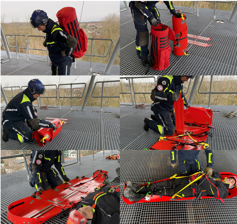
Demonstration of Rollup Enclosed Rescue Stretcher set-up