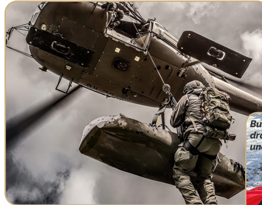
Bullnose design is ideal for drag in snow and undergrowth environments