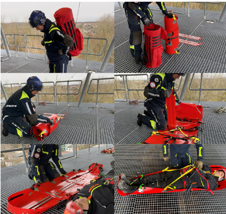
Demonstration of Rollup Enclosed Rescue Stretcher set-up