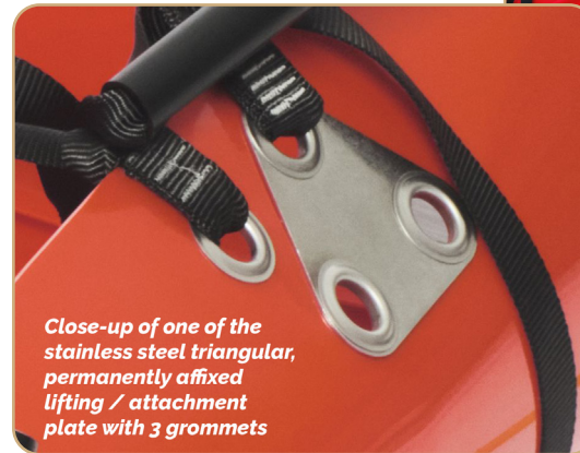
Close-up of one of the stainless steel triangular, permanently affixed lifting / attachment plate with 3 grommets