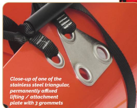
Close-up of one of the stainless steel triangular, permanently affixed lifting / attachment plate with 3 grommets