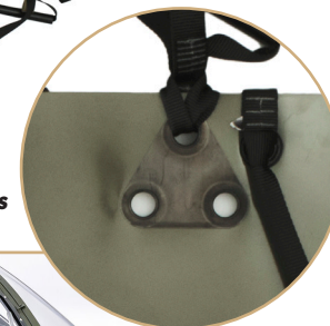
10 steel lifting/attachment plates with 3 grommets