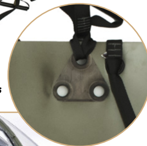
8 steel lifting/attachment plates with 3 grommets