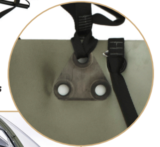
8 steel lifting/attachment plates with 3 grommets