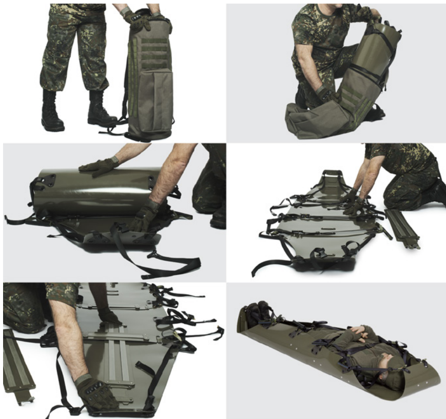
Demonstration of Rollup Rescue Stretcher set-up