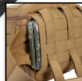
Rear pocket capable of holding a SAM® Splint II.