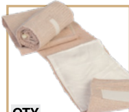
QTY 1 ETD® 4 in. Dressing, Flat