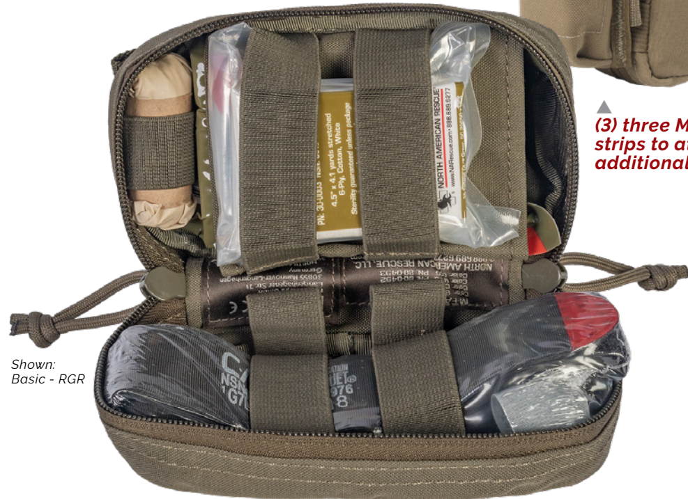
Shown: Basic - RGR

Learn more about this and other Products with a Mission® at www.NARescue.com