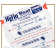
QTY 1 HyFin® Vent Compact, Twin Pk