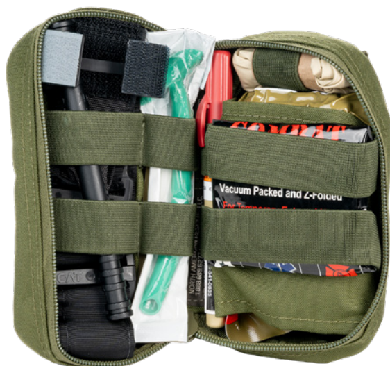
Shown: Advanced - ODG

The M-FAK's super compact, 500 Denier nylon bag opens from the side in a clam shell configuration utilizing (2) two main sleeves that open on both ends for easy access and features multiple elastic loops for secure gear organization. The bag's exterior includes a MOLLE backing for mounting in the standard vertical position as well as a 3 in. internal sleeve for accommodating horizontal attachment to your duty belt. The vertical mount can be set to open left-to-right or right-to-left based on shooter preference, while the horizontal mount on a belt allows opening directly to your C-A-T. ® tourniquet. Also included are a loop patch on front of the bag for custom user labeling and (3) three MOLLE strips to attach additional gear such as a TQ/Holder (sold separately) if needed.