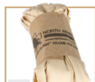
PAIR 1 Nitrile Gloves, Lg