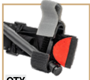
QTY 1 C-A-T® Tourniquet