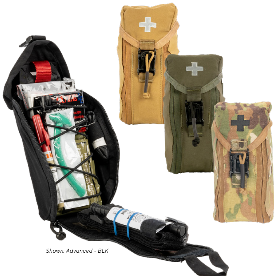
Shown: Advanced - BLK

The RIG Series Eagle IFAK is a new low profile individual first aid kit designed with a protective hood and quick latch release to keep your life-saving equipment protected and rapidly accessible for deployment. Highlighted design advancements include easy-one hand quick release hood latch and zippers, detachable inner shock cord panel that detaches from the IFAK bag and attachment system that allows both vertical (MOLLE backing) and horizontal (3 in. belt loop) carriage orientations. Kits come in 3 configurations: Basic, with Combat Gauze, and Advanced.