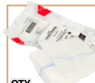
QTY 1 NAR® Gauze, Wound Packing