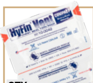
QTY 1 HyFin® Vent Compact, Twin Pk