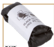
PAIR 1 Black Talon Nitrile Gloves, LG