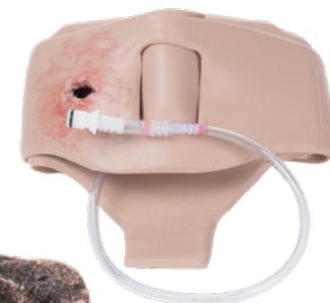
◀ Surgical Airway Trainer w/ Burns