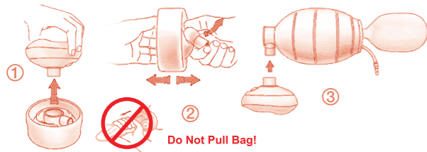
Figure 1 – Unpacking the Cyclone® New & Improved Pocket BVM®: