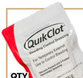
QTY 1 Bleeding Control Dressing