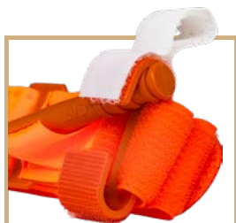
QTY 1 C-A-T® Tourniquet

Limited Time Offer - only available until May 1, 2018