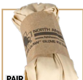
PAIR 1 Nitrile Gloves, Lg