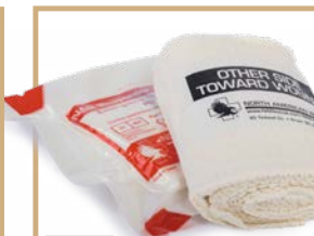
QTY 1 ETD™ 4 in. Responder, Flat