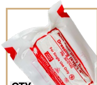
QTY 1 4 in. ETD™ Responder