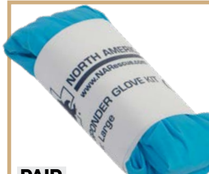
PAIR 1 Responder Nitrile Gloves, Lg