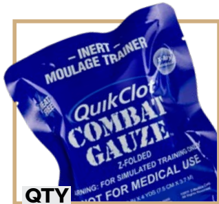
QTY 1 Combat Gauze® Trainer