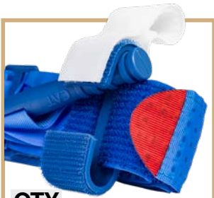
QTY 1 C-A-T® Blue Trainer