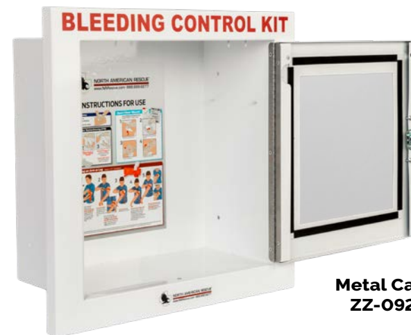
Metal Case: ZZ-0921