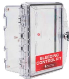
Small Individual Case: ZZ-1000