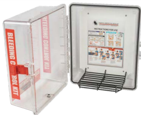
Large Multi Pack Case: ZZ-0822