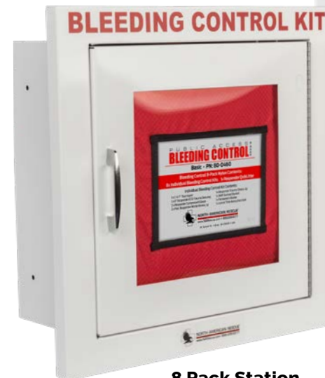
8 Pack Station