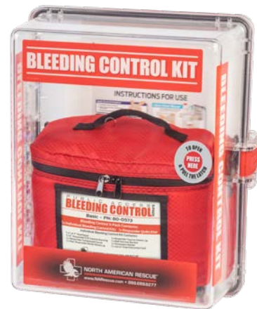
5 Pack Station