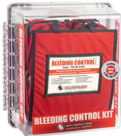
8 Pack Station