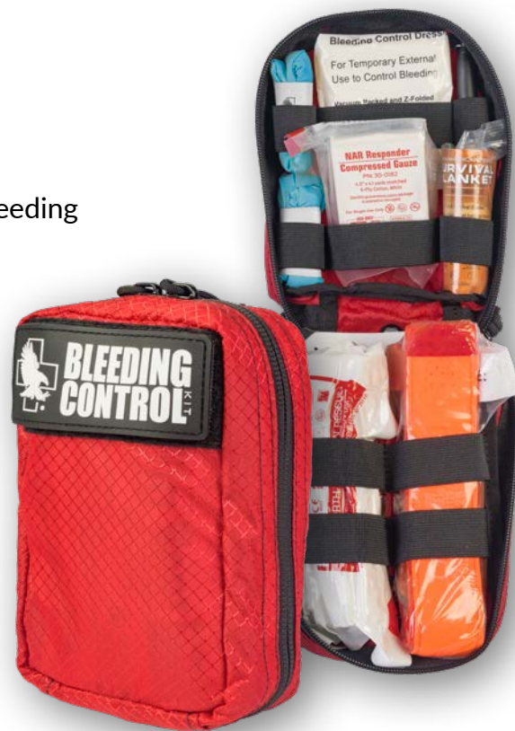
Nylon Bag Dimensions: H 7 in. x W 5 in. x D 2.75 in.

PLUS, these Individual Components based upon Configuration Choice: