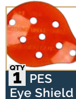
QTY 1 PES Eye Shield