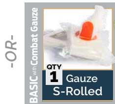
BASIC with Combat Gauze QTY 1 Gauze S-Rolled