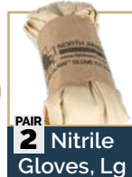
PAIR 2 Nitrile Gloves, Lg