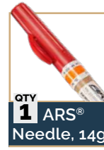
QTY 1 ARS® Needle, 14g