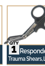
QTY 1 Responder Trauma Shears, Lg