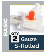
BASIC QTY 2 Gauze S-Rolled