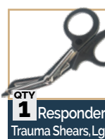
QTY 1 Responder Trauma Shears, Lg