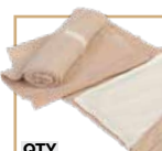
QTY 1 ETD™ 6 in. Dressing