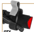
QTY 1 C-A-T® Tourniquet