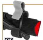
QTY 1 C-A-T® Tourniquet