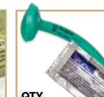
QTY 1 28F Naso Airway & Lube