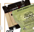
QTY 1 Choice of Hemostatic