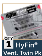
QTY 1 HyFin® Vent. Twin Pk