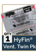
QTY 1 HyFin® Vent. Twin Pk