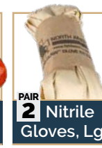
PAIR 2 Nitrile Gloves, Lg