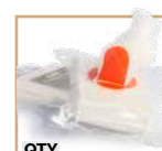
QTY 1 Gauze S-Rolled