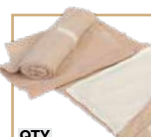
QTY 1 ETD™ 6 in. Dressing