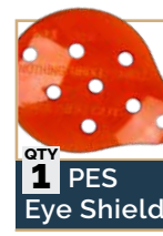
QTY 1 PES Eye Shield