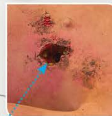
Sucking Chest Wound (Open Pneumothorax)