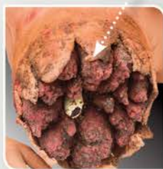
Amputation (Upper Thigh) above tourniquet line