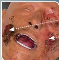
Gun Shot Wound (Face)