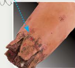
Amputation (Above Knee)