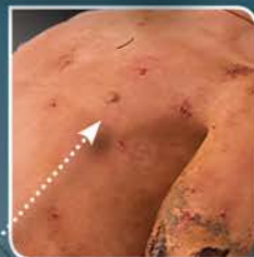
Burn, Blast & Fragment Wounds (Left Flank)