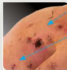
Fragment Wounds (Left Flank)