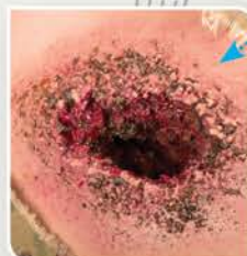
High Gun Shot Wound (Groin) above tourniquet line