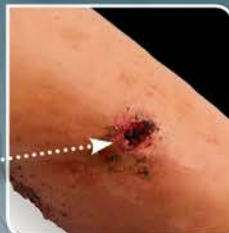
Gun Shot Wound (Upper Arm)

CTS/1 breathes, bleeds, moves head & has carotid pulse