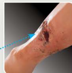
Open Fracture (Tib/Fib)