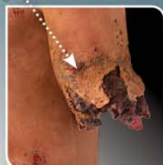
Amputation (Above Elbow)