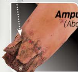
Amputation (Above Knee)