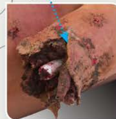
Amputation (Above Elbow)

CTS/4 breathes, bleeds, moves head and has carotid pulse