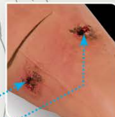
Gun Shot Wound (Thigh) through-and-through