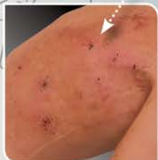
Fragment Wounds (Chest)