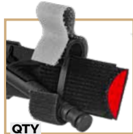
QTY 1 C-A-T® Tourniquet