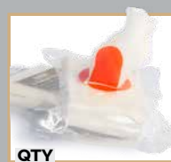
QTY 1 Gauze S-Rolled