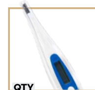
QTY 1 Veterinary Thermometer