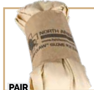
PAIR 1 Nitrile Gloves, Lg