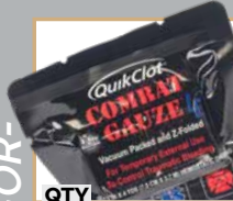
QTY 1 Combat Gauze® LE