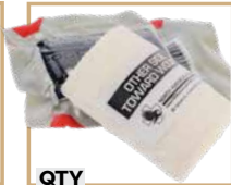
QTY 1 ETD™ 4 in. Mini Responder