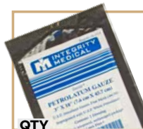
QTY 2 Gauze, Petrolatum