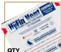
QTY 1 HyFin® Vent Compact, Twin