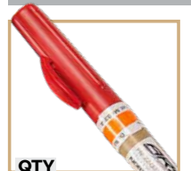
QTY 1 ARS® Needle, 14g