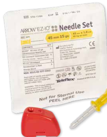
45 mm Needle Set

EZ-IO Products are restricted to Federal Purchases only. Please contact Customer Service for details.