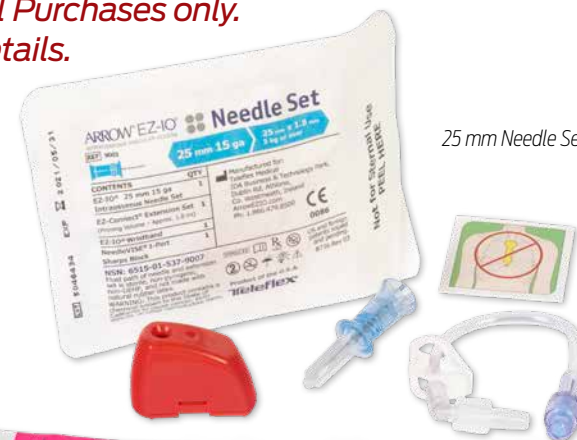
25 mm Needle Set

*Caution: Federal (USA) law restricts this device to sale by or on the order of a practitioner licensed to use or order use of the device or Federal (USA) law prohibits dispensing without a prescription.