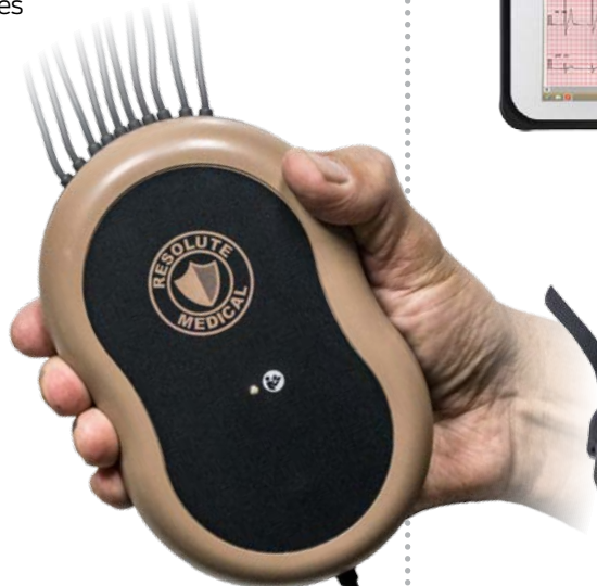
MedicECG ® Lite (no tablet)