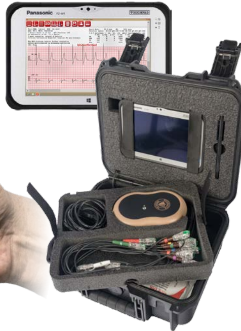
MedicECG ® Compact (with 7 in. FZ-M1 Toughpad ® tablet)