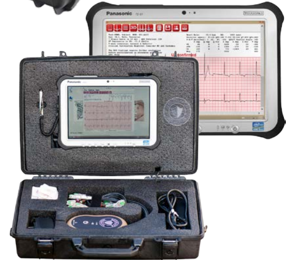
MedicECG ® Elite (with 10 in. FZ-G1 Toughpad ® tablet)